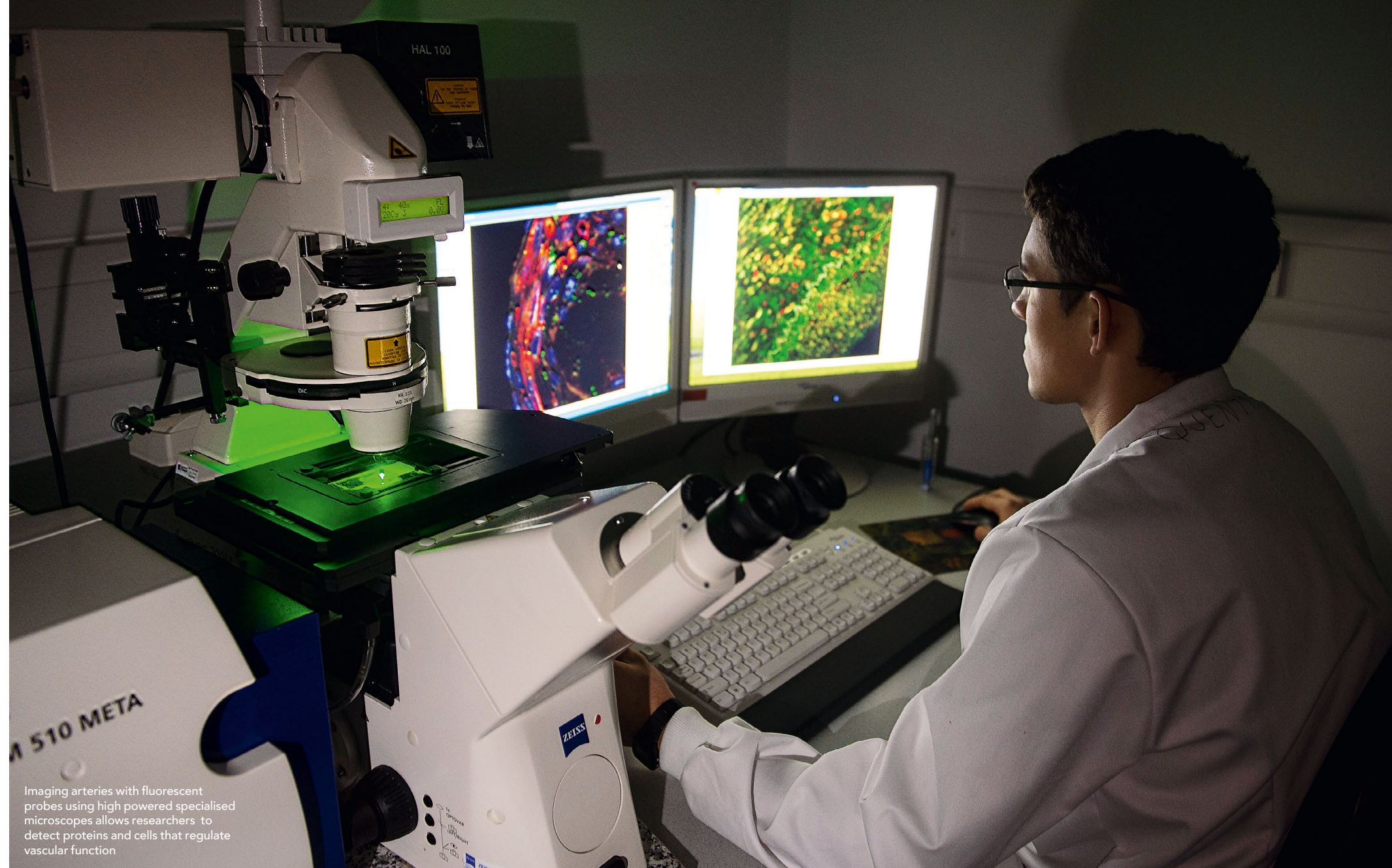
Imaging arteries with fluorescent probes using high powered specialised microscopes allows researchers to detect proteins and cells that regulate vascular function

We have conducted a vast amount of research on statins and how they influence cardiovascular and cardiometabolic disease, especially in relation to the treatment of diabetes. These new breakthroughs will be published later this year.