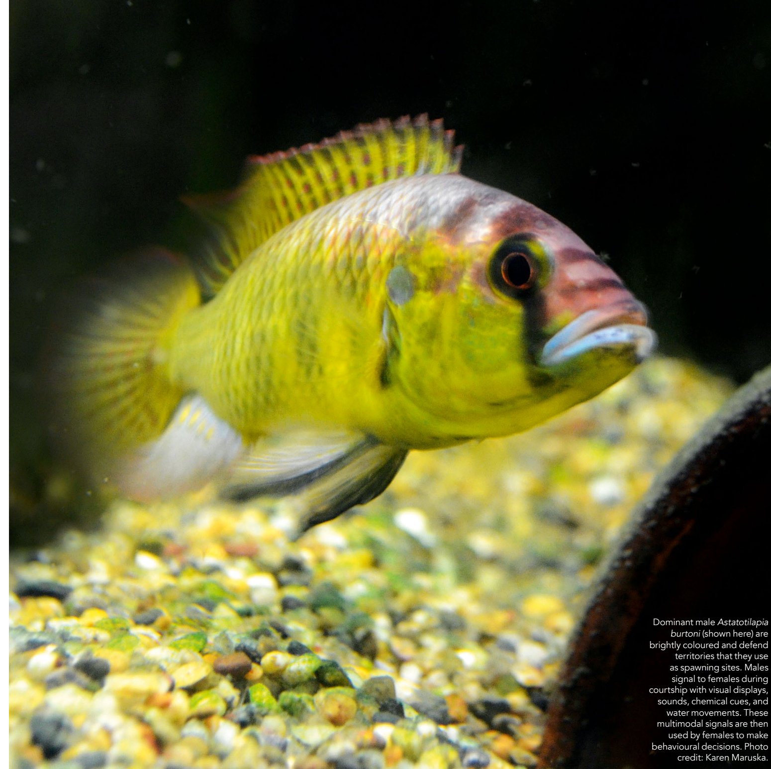
Dominant male Astatotilapia burtoni (shown here) are brightly coloured and defend territories that they use as spawning sites. Males signal to females during courtship with visual displays, sounds, chemical cues, and water movements. These multimodal signals are then used by females to make behavioural decisions.

How do females use male courtship signals, and where in the female brain are these