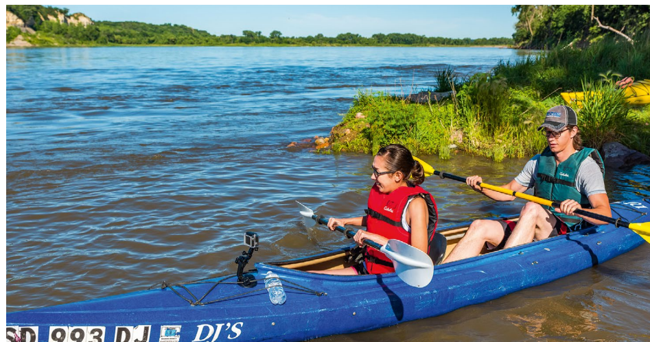
Sustainable RIVER students participated in six field trips, including two interpretive paddles on the river, covering more than 1000 km of the UMR.

Since the suspended load is nutrient rich, it is critical that we learn more about tributary contributions to the Missouri River,” stated Dr Mark Sweeney.